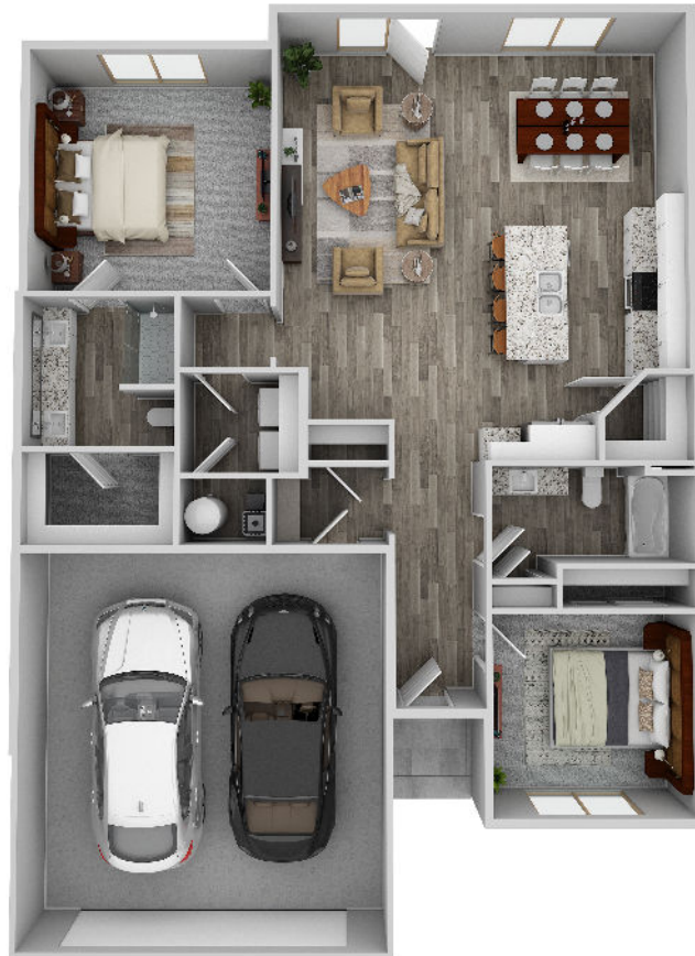
UNIT C PLAN 1474 WAXBERRY WAY